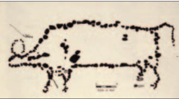
Bison Effigy near Big Beaver

Saskatchewan's Heritage Property Act defines rock paintings and carvings, medicine wheels, boulder effigies and other ancient boulder monuments as archaeological heritage "Sites of a Special Nature." These fragile and unique sites are a reflection of First Nations' past, and a vital link to the continuing spirituality, cultural traditions, and heritage of First Nations today.