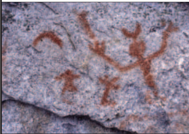
Pictograph Churchill River

medicine wheel, or other Site of a Special Nature is guilty of an offence and is liable on summary conviction to a fine and/or imprisonment. All contraventions should be reported to the local RCMP detachment or to the provincial Heritage office at 1-306-787-2817, or by e-mail at info@cyr.gov.sk.ca .