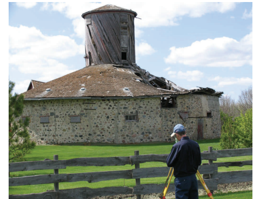
Specialized photogrammetric recording of the Bell Round Barn, near Indian Head—May, 2006