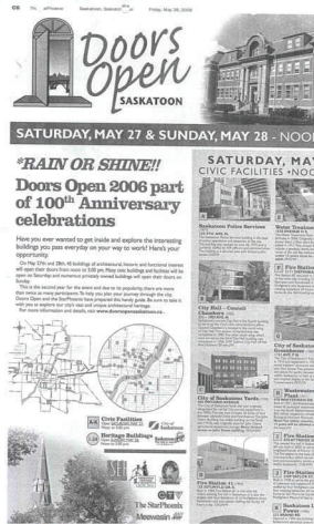
Saskatoon "Doors Open" Event—May, 2006